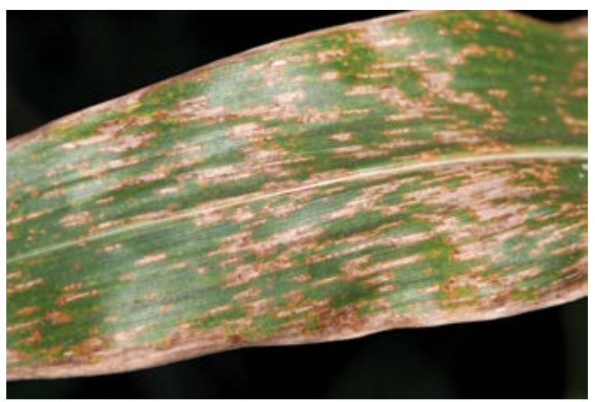
Figure 3. Corn leaf showing an advanced stage of gray leaf spot infection.

weather, the lesions rapidly merge, killing entire leaves (Figure 3). Extensive blighting may continue until all leaves on a plant are killed. Plants in this situation incur significant yield loss and are more susceptible to serious stalk rotting and lodging.