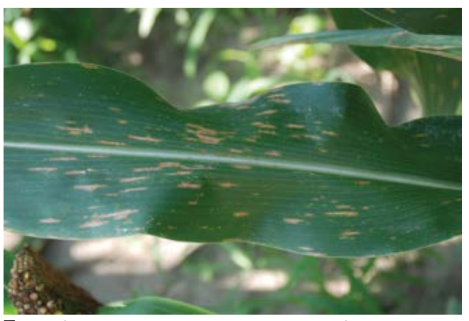
Figure 2. Expanded lesions one to two weeks after initial infection.